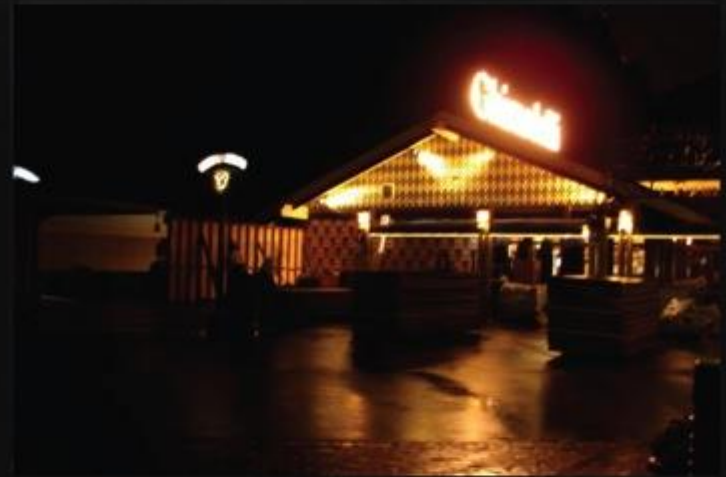
Setting up the Dust Screen