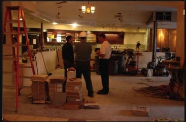
Meeting with a host of building officials and Disney managers