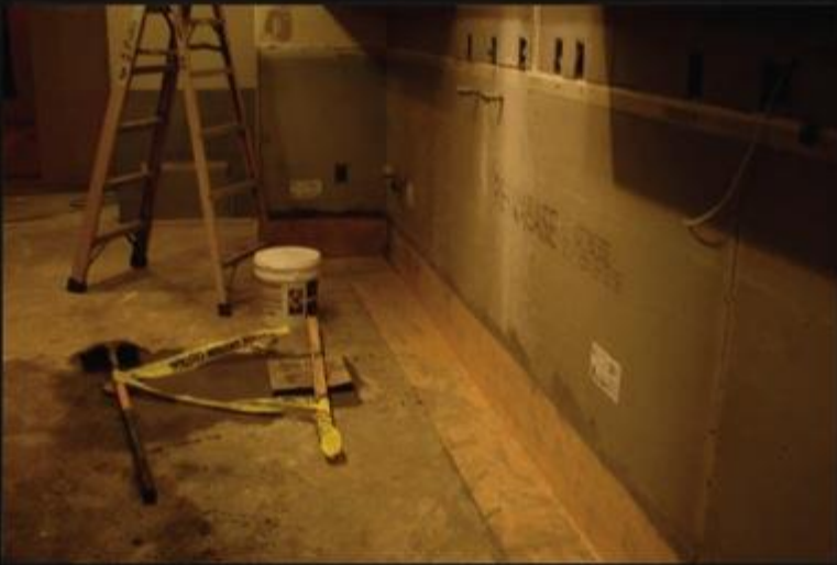
Installing a waterproof membrane behind the Service Line