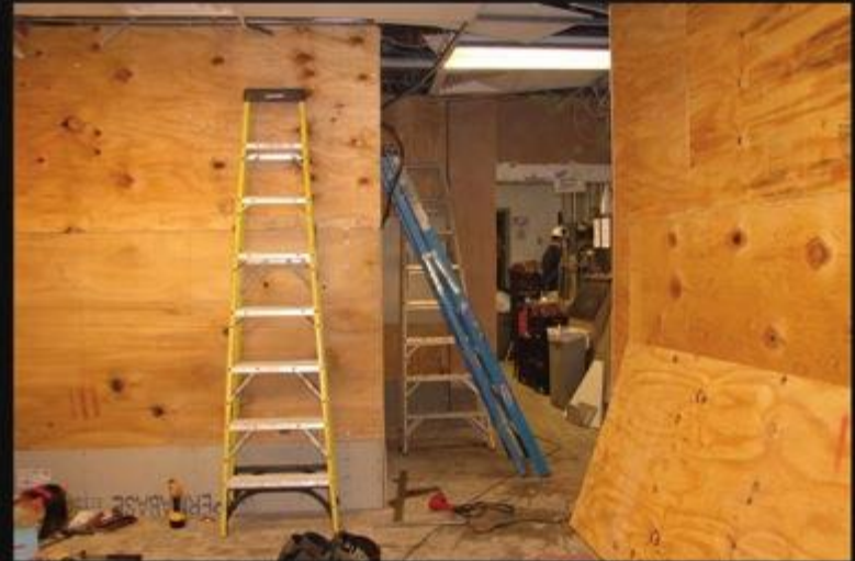
Running electrical wires to Disney's new water meter located inside the Boiler Room behind the structure -- an additional scope item