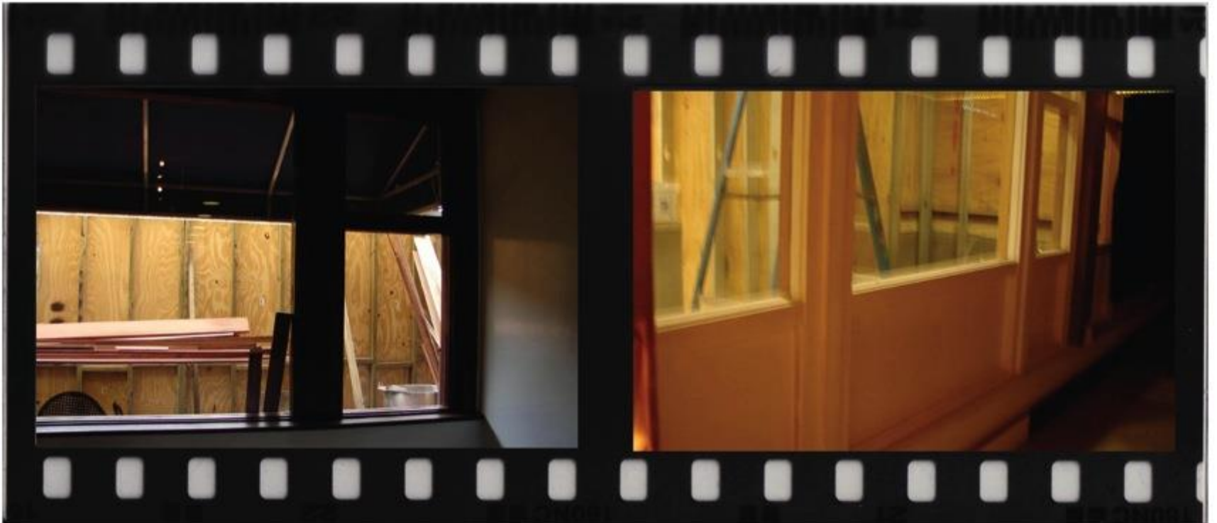
Replacing Mahogany window trim with the same