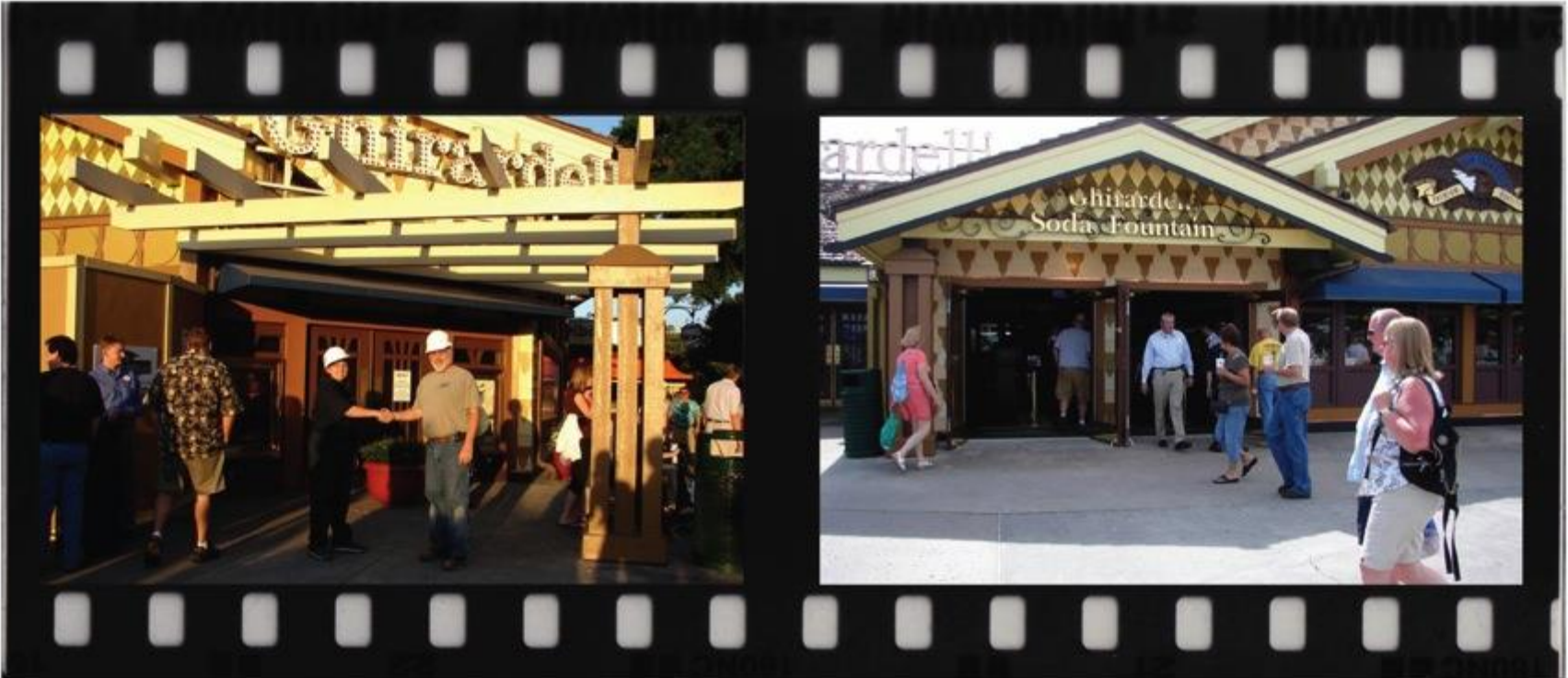
The doors open for business at the Retail Area on April 11