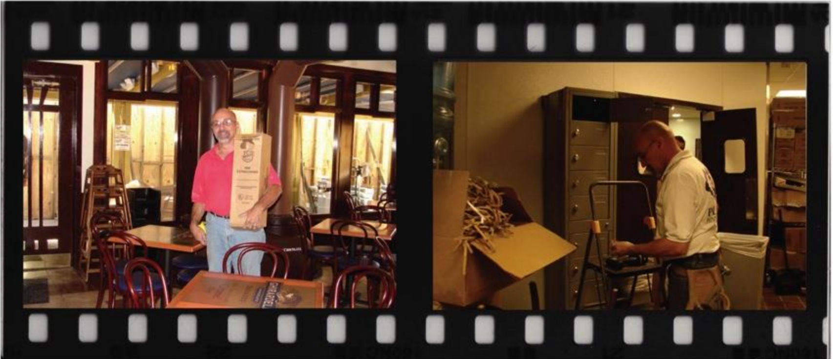
Putting the final touches on the job as opening day approaches