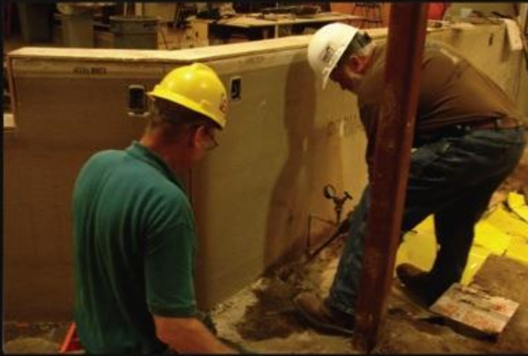
Redirecting the soda chase to enable it to come up underneath a relocated soda tower