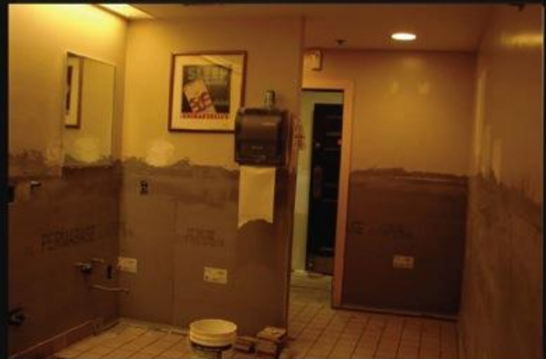
Hanging Permabase, setting ceramic and quarry tile, and repairing walls in the Men's and Women's Restrooms. Wallcovering followed.