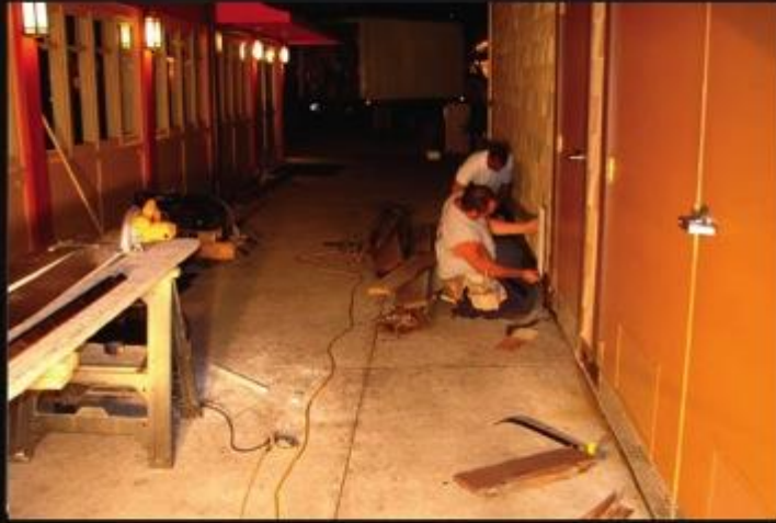
Replacing brittle shingles throughout the building's exterior