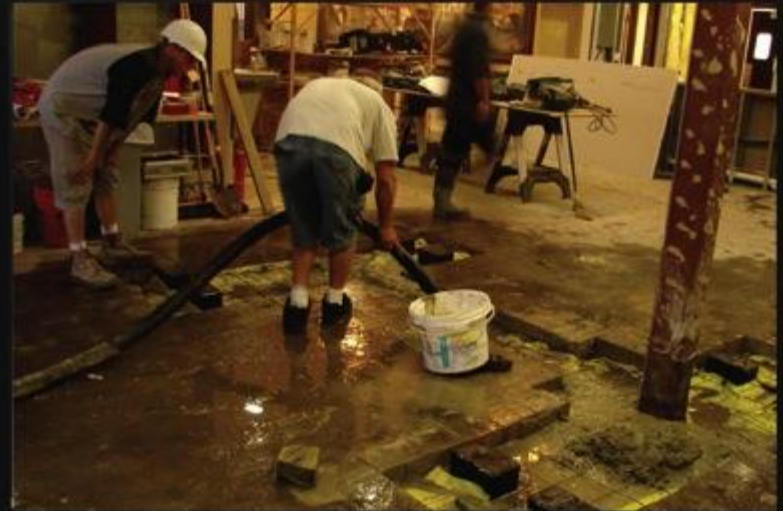
This concrete pour is for the Service Line and Point of Service Areas -- the latter area having received new electrical floor boxes as part of the additional scope items