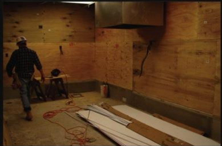
Sheathing the walls with plywood above the Permabase after taking remediation measures throughout the Dish Wash Area