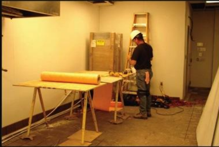
Installing a waterproof membrane at the baseline, which also received one-foot-deep concrete edging between the studs throughout the Dish Wash Area