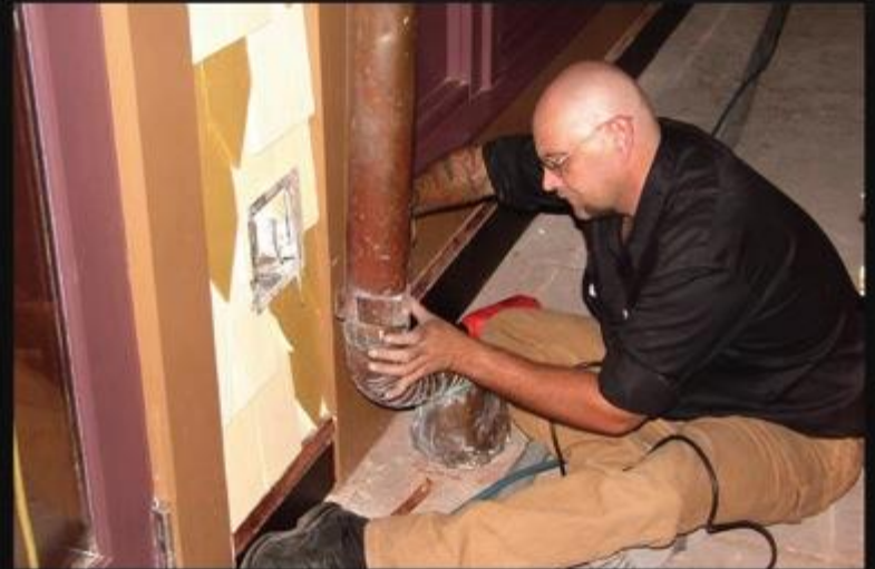
Replacing the copper downspouts and/or their bands wherever necessary, and creating an antiqued look in keeping with the existing downspouts