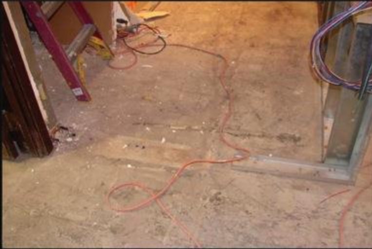
Re-working the wall by the Pass-Thru and Vestibule Areas leading to the Restrooms