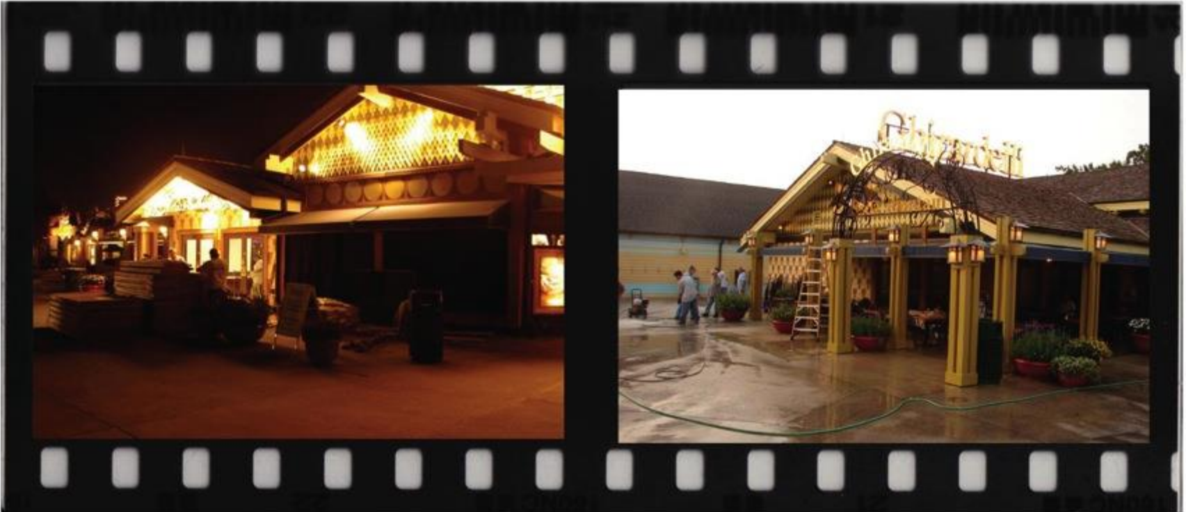
Removing the Dust Screen