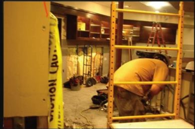
Remediation measures taken where necessary behind the Service Line, followed by insulation and Permapase