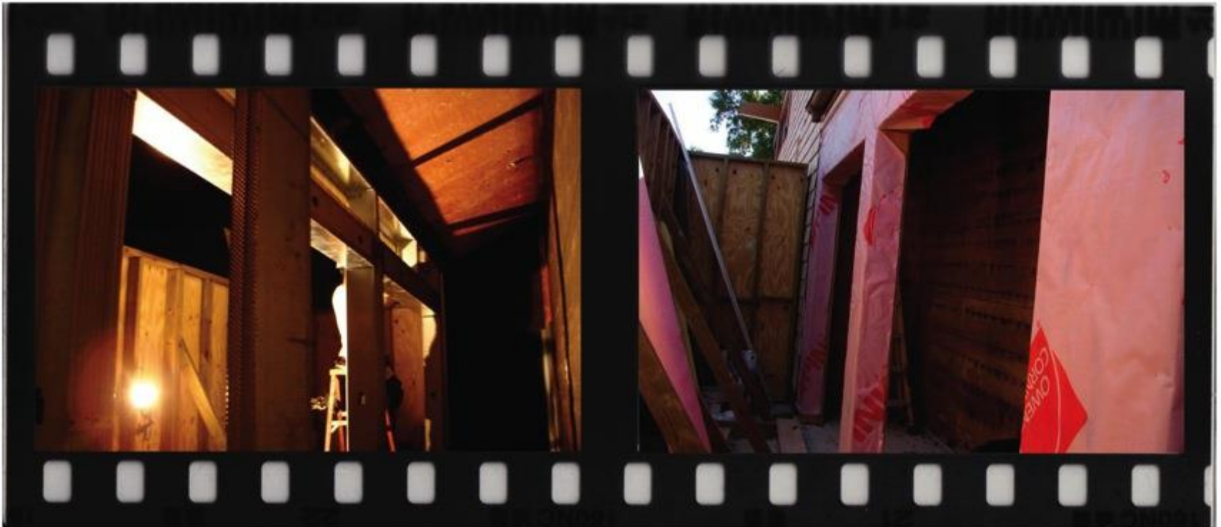
Working on the Storage Room at the back of the building