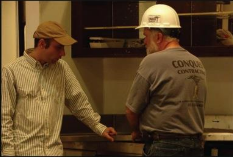
Conferring with our Client