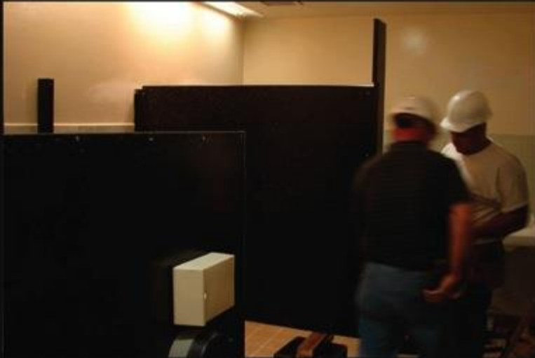
Re-installing the Restroom partitions