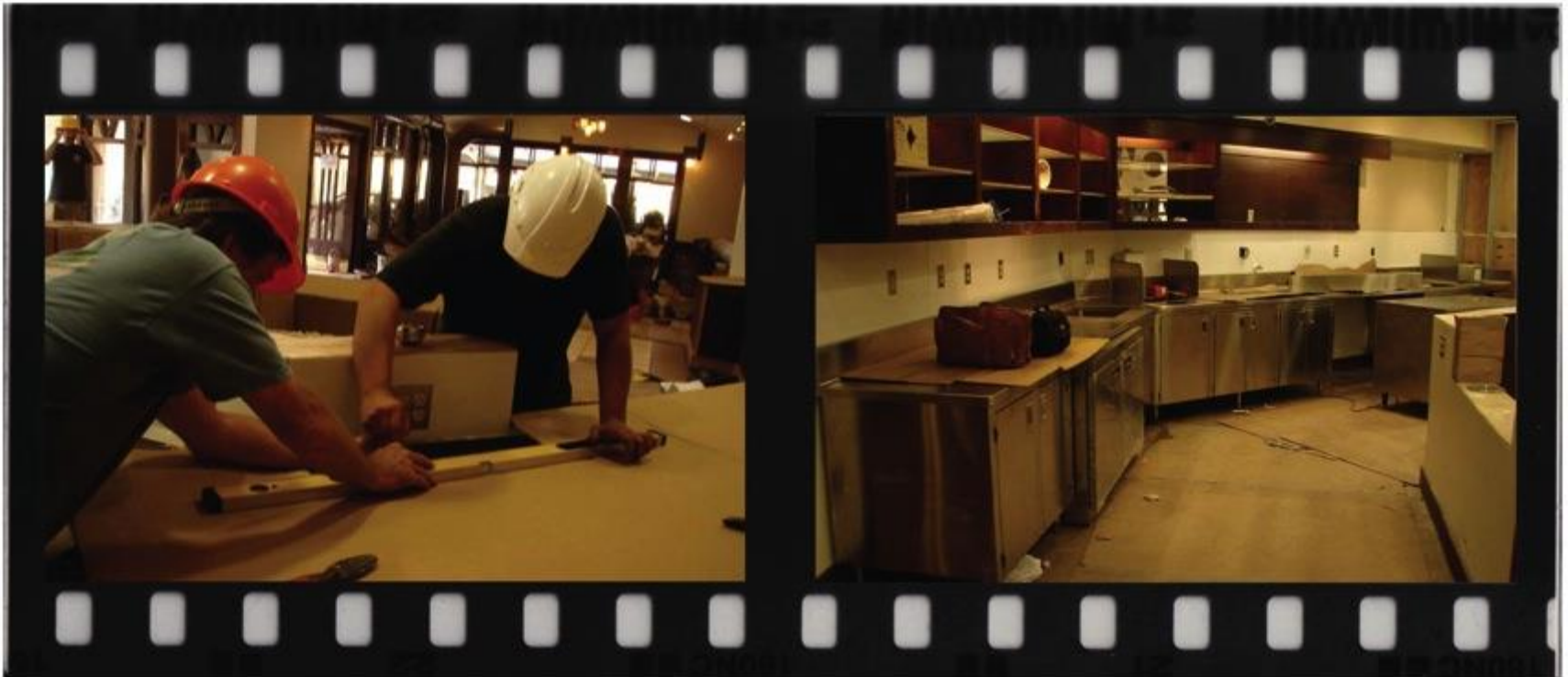
The stainless steel crew setting in their cabinetry