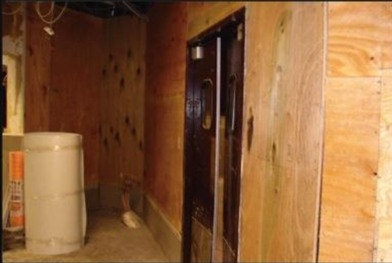
Readying the Back of the House for FRP. Ceiling repairs follow.