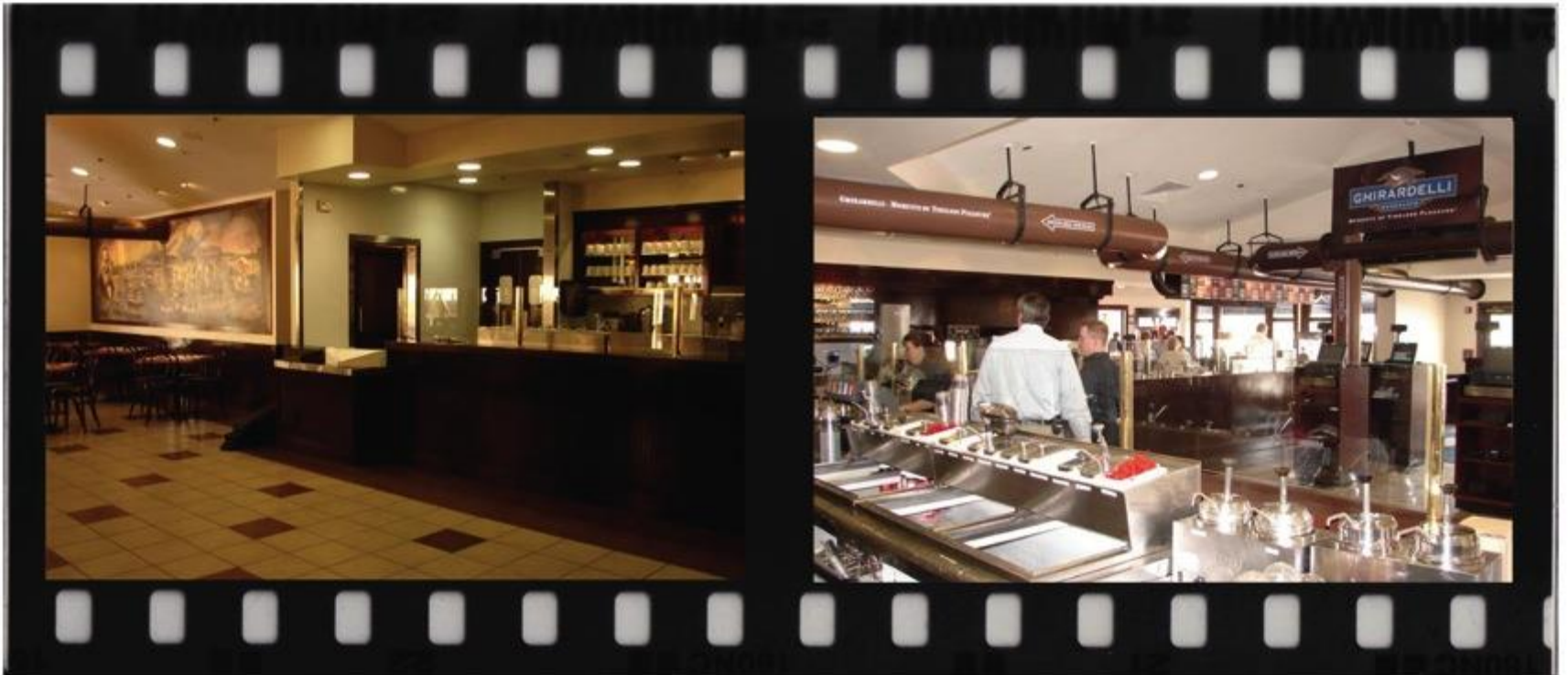
Getting the interior ready to receive guests