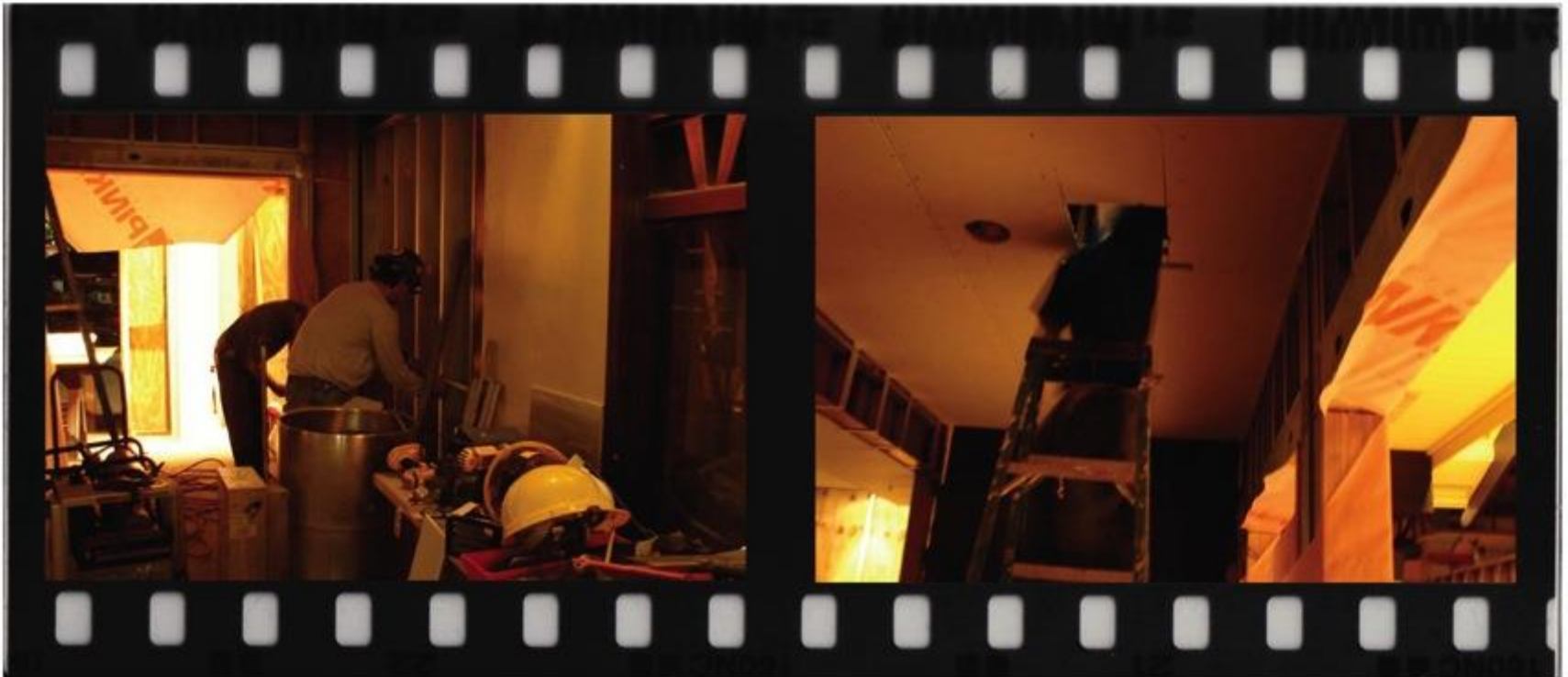
Building the New Addition at the Front of the House